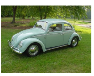
A VW Beetle, cheap and cheerful entry into the world of car ownership. The Author's first set of wheels. $300, six years old.